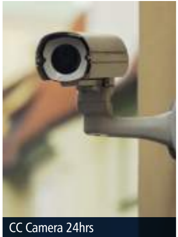
CC Camera 24hrs