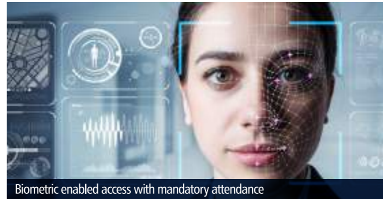
Biometric enabled access with mandatory attendance