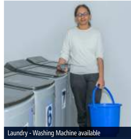
Laundry - Washing Machine available