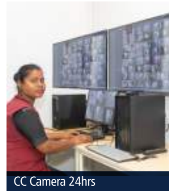
CC Camera 24hrs