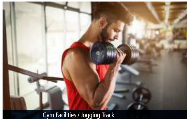
Gym Facilities / Jogging Track