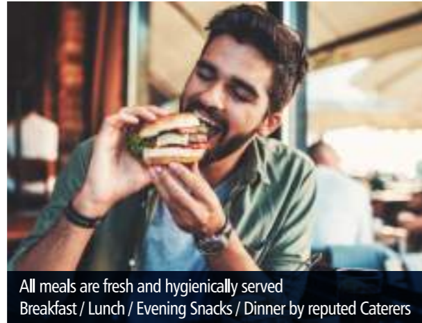
All meals are fresh and hygienically served Breakfast / Lunch / Evening Snacks / Dinner by reputed Caterers