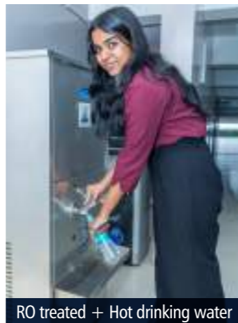
RO treated + Hot drinking water