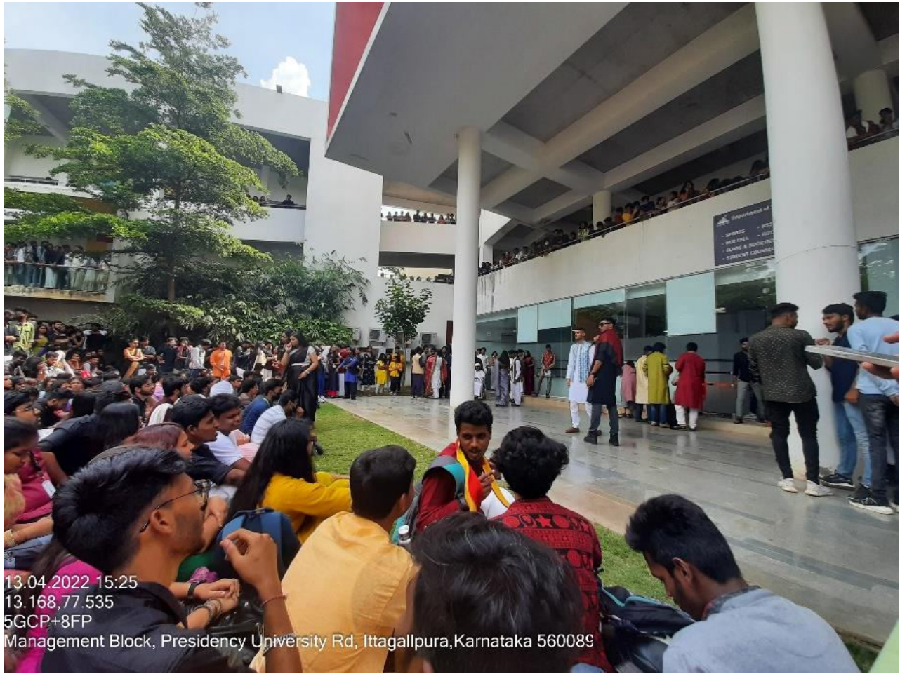
13.04.2022 15:25 13.168,77.535 5GCP+8FP Management Block, Presidency University Rd, Ittagallpura, Karnataka 560089