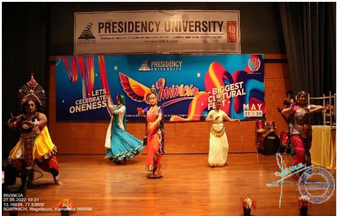
INVINCIA 27.05.2022 10:31 13.16835, 77.53809 5G9P+9CH, Ittagallpura, Karnataka 560089