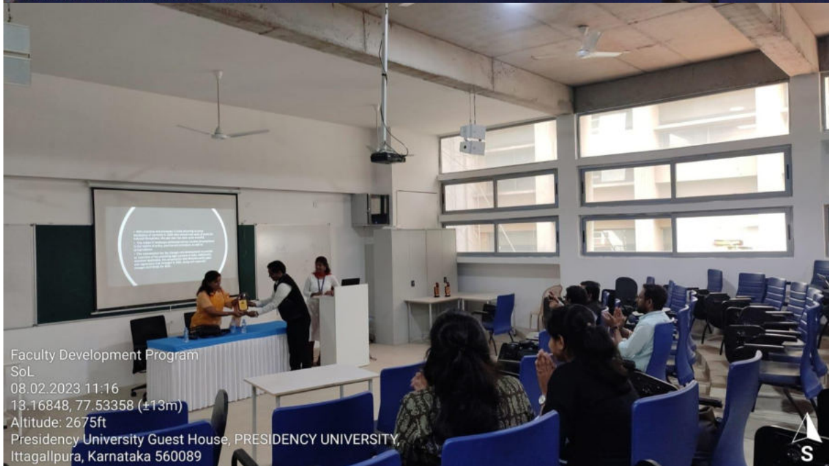
Faculty Development Program SoL 08.02.2023 11:16 13.16848, 77.53358 (±13m) Altitude: 2675ft Presidency University Guest House, PRESIDENCY UNIVERSITY, Ittagallpura, Karnataka 560089