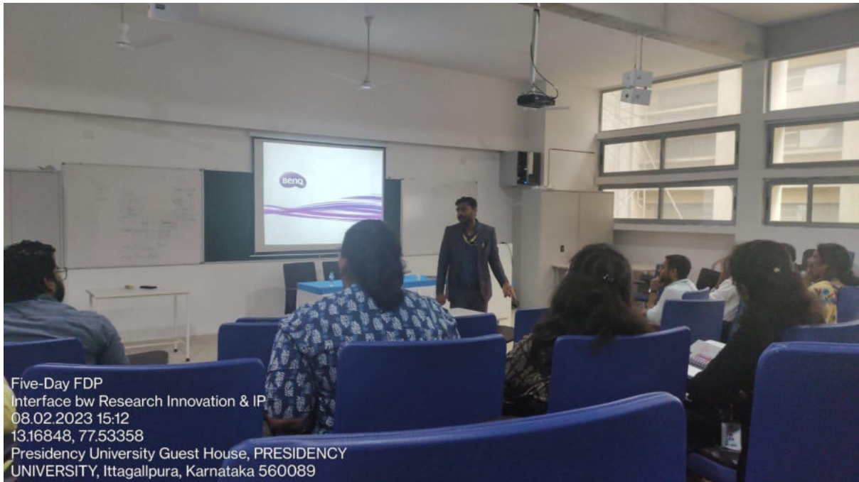
Five-Day FDP Interface bw Research Innovation & IP 08.02.2023 15:12 13.16848, 77.53358 Presidency University Guest House, PRESIDENCY UNIVERSITY, Ittagallpura, Karnataka 560089