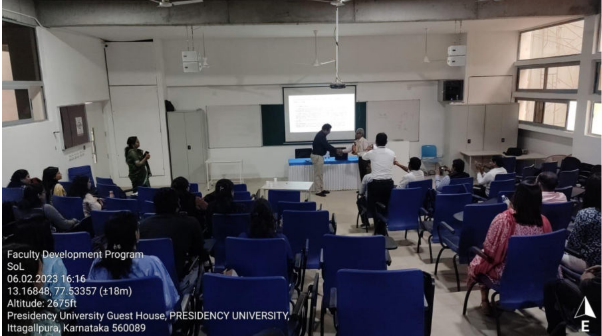
Faculty Development Program SoL 06.02.2023 16:16 13.16848, 77.53357 (±18m) Altitude: 2675ft Presidency University Guest House, PRESIDENCY UNIVERSITY, ITTAGALLPURA, KARNATAKA 560089