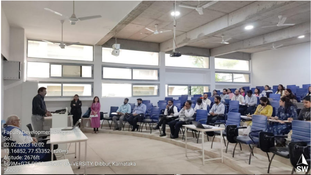
Faculty Development Program SoL 02.02.2023 10:02 13.16852, 77.53352 (±20m) Altitude: 2676ft 5G9M+G75 PRESIDENCY UNIVERSITY, DIBBUR, KARNATAKA 560089