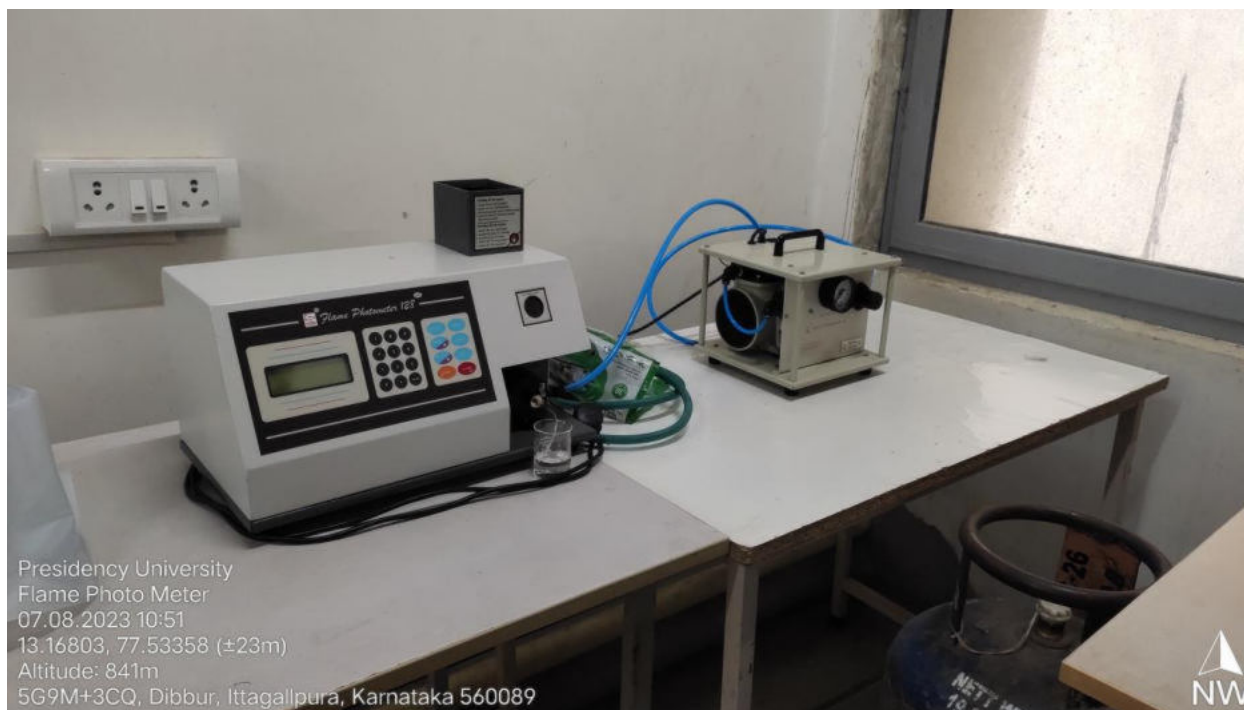
Presidency University Flame Photo Meter 07.08.2023 10:51 13.16803, 77.53358 ( \pm 23m ) Altitude: 841m 5G9M+3CQ, Dibbur, Ittagallpura, Karnataka 560089

Itgalpur, Rajanakunte, Yelahanka, Bengaluru 560 064