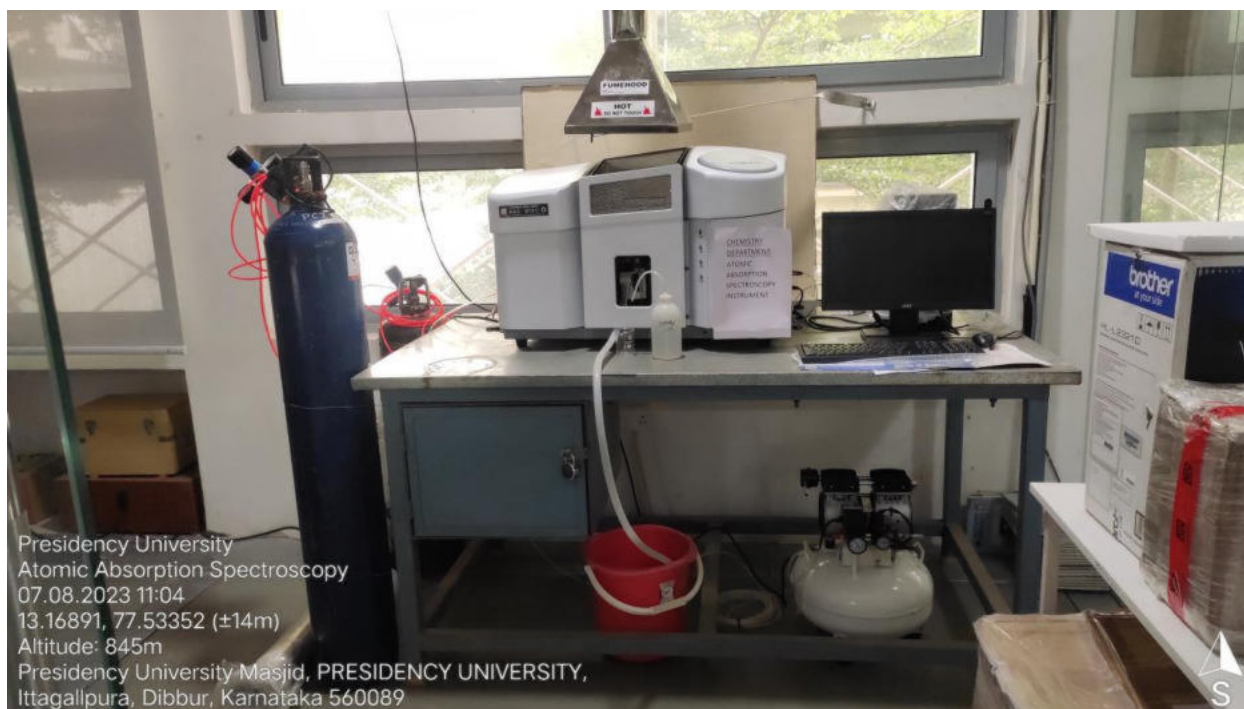
Presidency University Atomic Absorption Spectroscopy 07.08.2023 11:04 13.16891, 77.53352 ( \pm 14m ) Altitude: 845m Presidency University Masjid, PRESIDENCY UNIVERSITY, Ittagallpura, Dibbur, Karnataka 560089

Presidency University Act, 2013 of the Karnataka Act No. 41 of 2013 | Established under Section 2(f) of UGC Act, 1956 Approved by AICTE, New Delhi