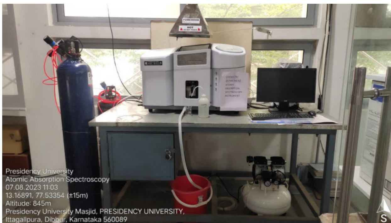
Presidency University Atomic Absorption Spectroscopy 07.08.2023 11:03 13.16891, 77.53354 (±15m) Altitude: 845m Presidency University Masjid, PRESIDENCY UNIVERSITY, Ittagalpur, Dibbur, Karnataka 560089