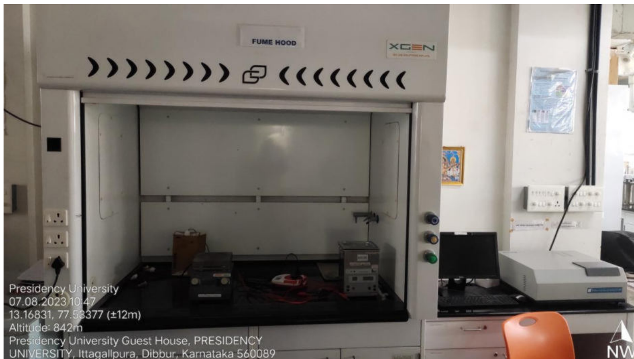
Presidency University 07.08.2023 10:47 13.16831, 77.53377 (±12m) Altitude: 842m Presidency University Guest House, PRESIDENCY UNIVERSITY, Ittagallpura, Dibbur, Karnataka 560089

Presidency University Act, 2013 of the Karnataka Act No. 41 of 2013 | Established under Section 2(f) of UGC Act, 1956 Approved by AICTE, New Delhi