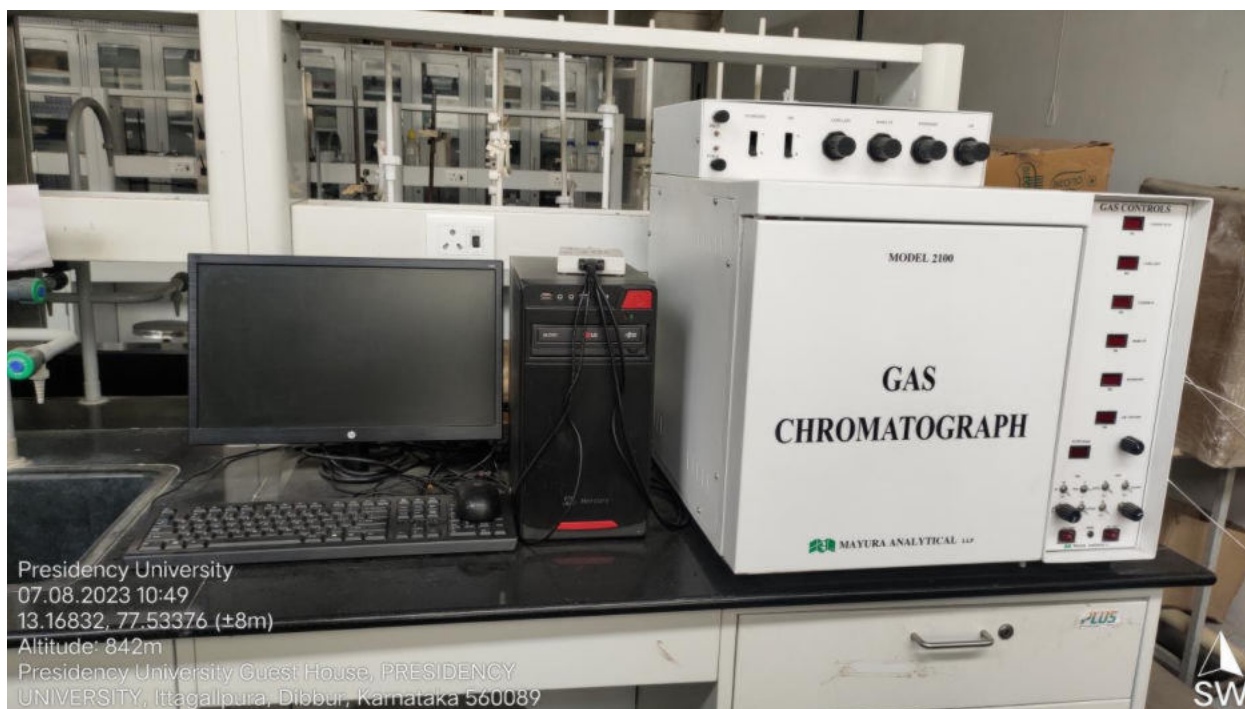
Presidency University 07.08.2023 10:49 13.16832, 77.53376 (±8m) Altitude: 842m Presidency University Guest House, PRESIDENCY UNIVERSITY, Ittagallpura, Dibbur, Karnataka 560089