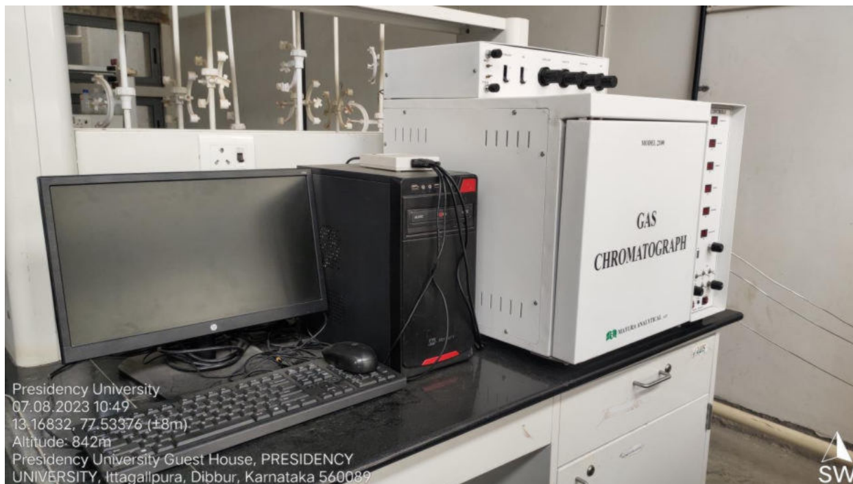
Presidency University 07.08.2023 10:49 13.16832, 77.53376 (+8m) Altitude: 842m Presidency University Guest House, PRESIDENCY UNIVERSITY, Ittagalpur, Dibbur, Karnataka 560089

Presidency University Act, 2013 of the Karnataka Act No. 41 of 2013 | Established under Section 2(f) of UGC Act, 1956 Approved by AICTE, New Delhi