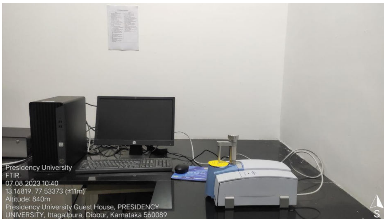
Presidency University FTIR 07.08.2023 10:40 13.16819, 77.53373 (±11m) Altitude: 840m Presidency University Guest House, PRESIDENCY UNIVERSITY, Ittagallpura, Dibbur, Karnataka 560089

Presidency University Act, 2013 of the Karnataka Act No. 41 of 2013 | Established under Section 2(f) of UGC Act, 1956 Approved by AICTE, New Delhi