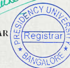
Vice Chancellor Presidency University