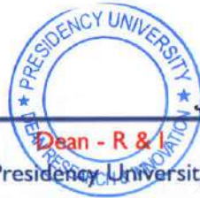
Dean - R & I Presidency University