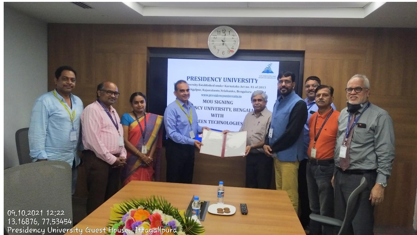
MoU Signing ceremony- October 2021