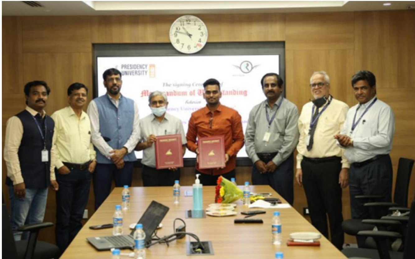
MoU Signing & Exchange Ceremony May 2022