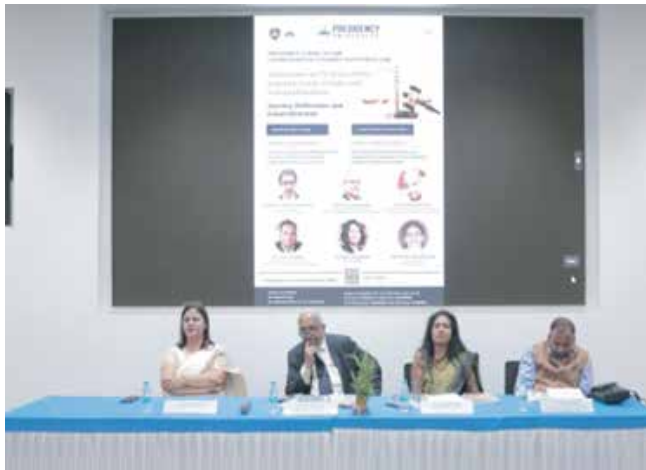
Symposium on 75 Years of the Supreme Court of India and Constitutionalism, 7th March 2025