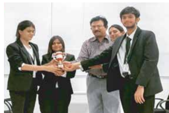
VIDHI KA VIDHAN – A Pro Bono Trial Advocacy Competition on the 12th of May, 2023, at Presidency School of Law, Bengaluru.