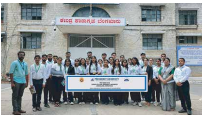
Parapana Agrahara Central Jail Visit, on 19th October, 2023.