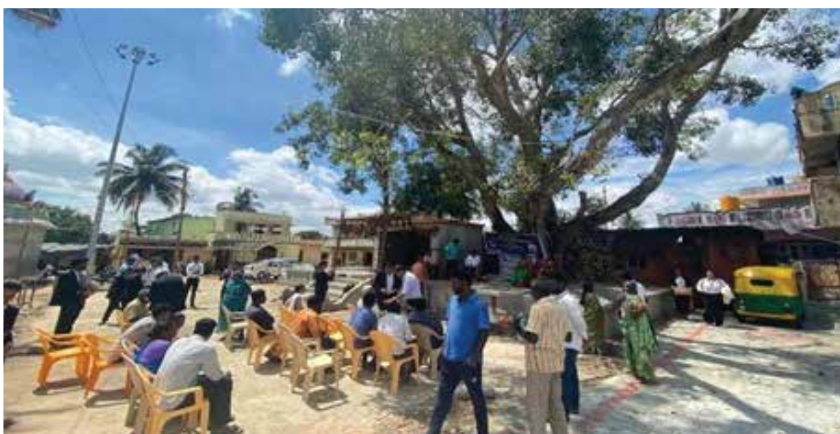
Jan Sunwai, in collaboration with the Legal Aid Cell of the Presidency School of Law, conducted on 15th October, 2022.