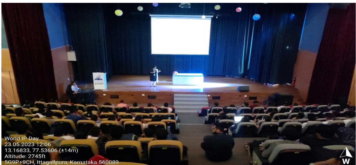
World IP Day 23.05.2023 12:06 13.16833, 77.53606 (±14m) Altitude: 2745ft 5G9P+9CH, Ittagallpura, Karnataka 560089